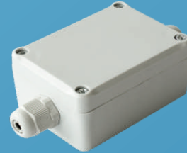
1Wire® temperature sensor (TTJ)