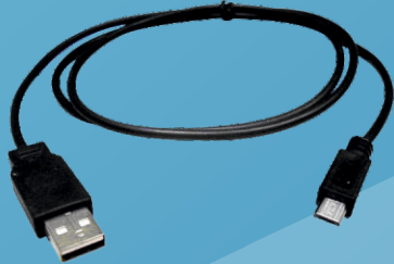
USB to micro USB cable