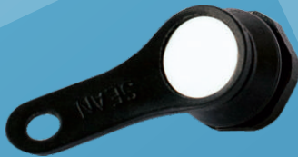
1Wire® iButton and iButton reader